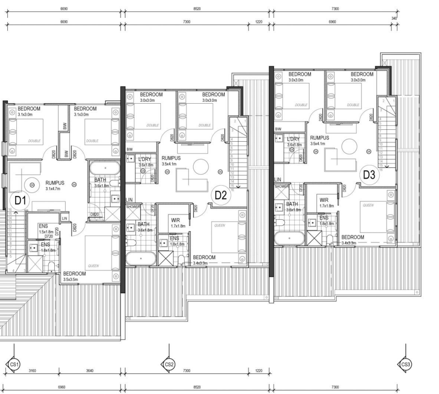
FIRST FLOOR PLAN D1, D2 AND D3 SCALE 1:100